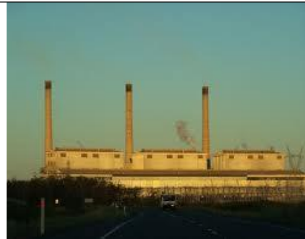
Gladstone – 6 x 280MW units. Fuel: black bituminous coal. Condensate cooling: lake cooling.