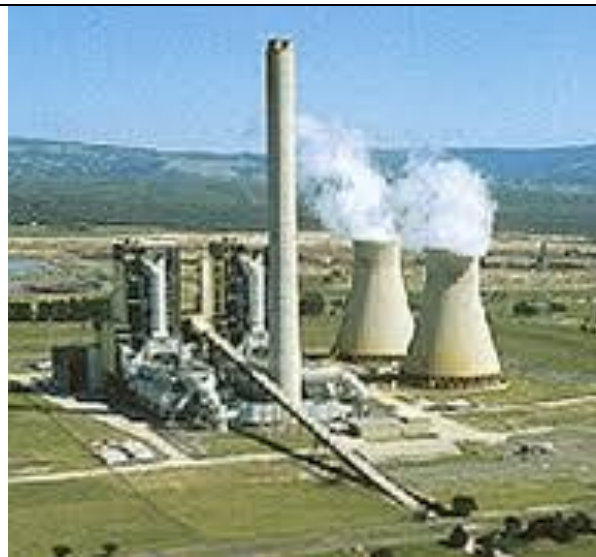
Loy Yang B – 2 x 500MW units. Fuel: brown coal. Condensate cooling: cooling towers.