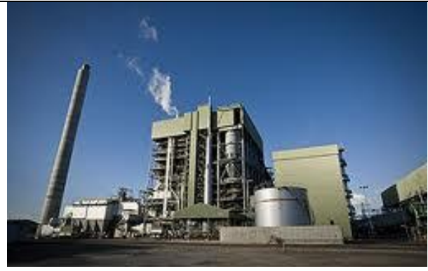
Kogan Creek – 1 x 750 MW unit. Fuel: black bituminous coal. Condensate cooling: air cooled.