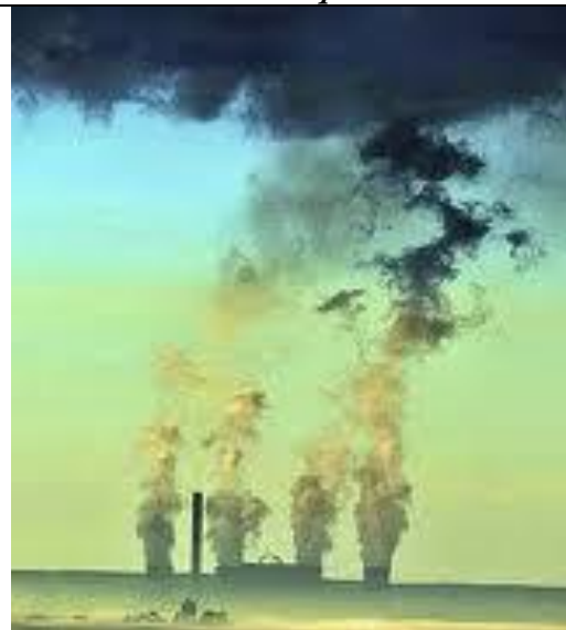
Photos 'doctored' by a Melbourne newspaper. Notice how the black 'smoke' does not even reach the chimneys! A very poor effort. The white clouds are pure water vapour evaporating from the cooling towers.

There are other power stations but those above serve as a clear example of how clean power stations really are.