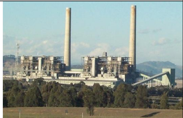
Liddell - 4 x 500MW units.

Fuel: black bituminous coal. Condensate cooling: cooling towers