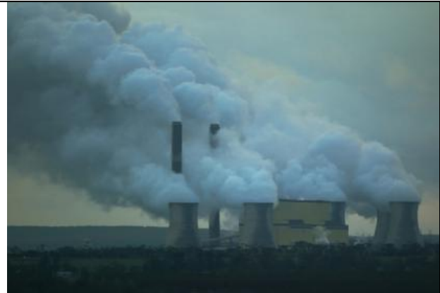
This is what 'The Greens' do to a photo in order to tell lies! Same power station at full load; the photos have been 'doctored' to make it look bad. Compare the difference!