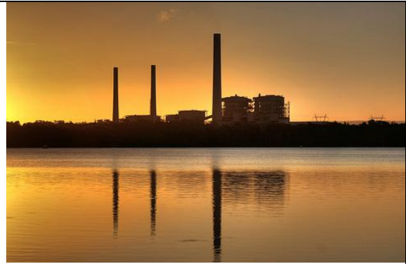
Vales Point B Stations. 2 x 660MW units. Fuel: black bituminous coal. Condensate cooling: lake cooled.