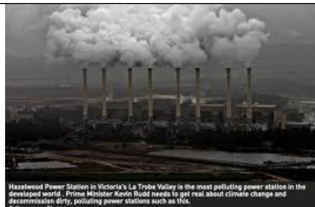
Hazelwood Power Station in Victoria's La Trobe Valley is the most polluting power station in the developed world. Prime Minister Kevin Rudd needs to get real about climate change and decommission dirty, polluting power stations such as this.