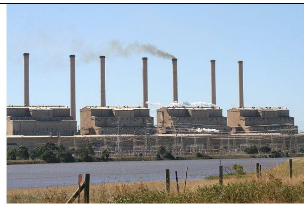
Hazelwood – 6 x 280MW units. Fuel: brown coal. Condensate cooling: lake cooling.