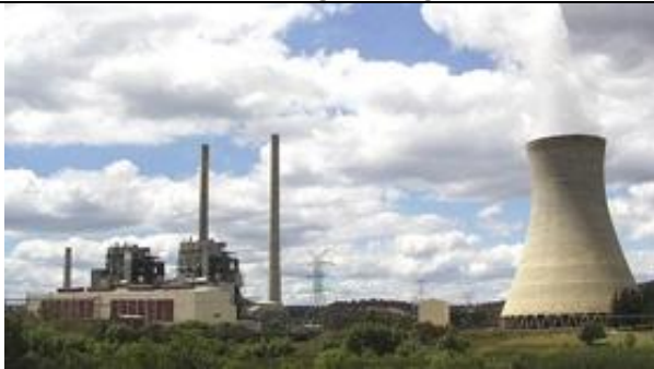
Wallerang C – 2 x 500MW units. Fuel: black bituminous coal. Condensate Cooling: cooling towers.