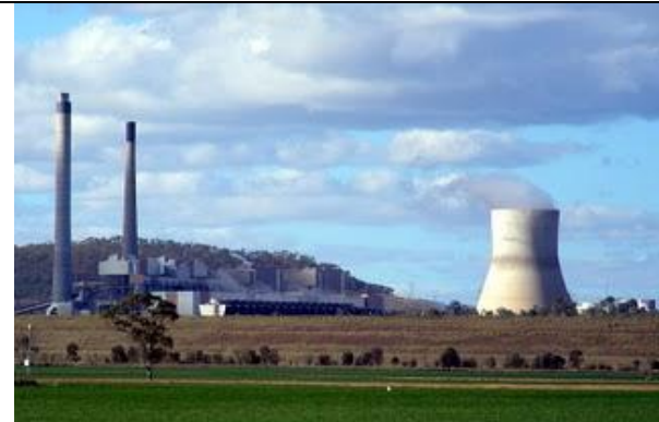
Callide - 2 x 350MW units, 2 x 450MW units. Fuel: black bituminous coal. Cooling condensate: lake for B Station; cooling tower for C Station.