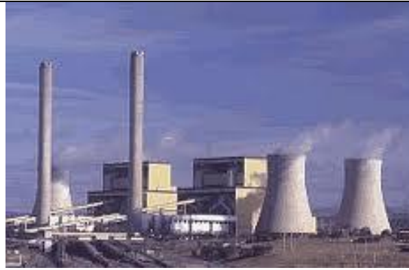
Loy Yang A – 4 x 500MW units. Fuel: brown coal. Condensate cooling: cooling towers.