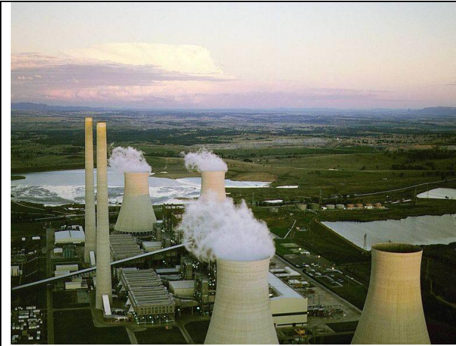
Bayswater – 4 x 660 Megawatts units.

Black bituminous coal. Condensate cooling: cooling towers. (One unit off-line.)