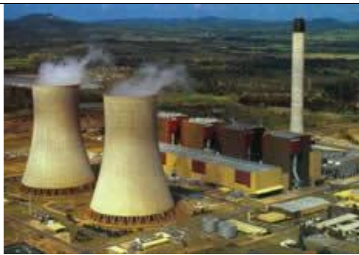
Stanwell (near Rockhampton) – 4 x 350MW units. Fuel: black bituminous coal. Condensate cooling: cooling towers.