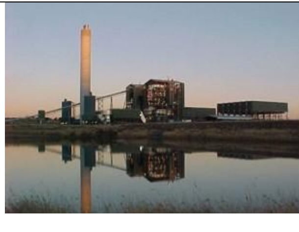
Milmerren – 4 x 440MW units. Fuel: black bituminous coal. Condensate cooling: air cooled