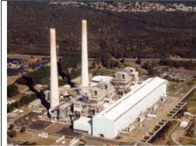
Munmorah - originally 4 x 350MW units. (2 units mothballed, and 2 units now 300MWs.) Fuel: black bituminous coal. Condensate cooling: cooling towers.