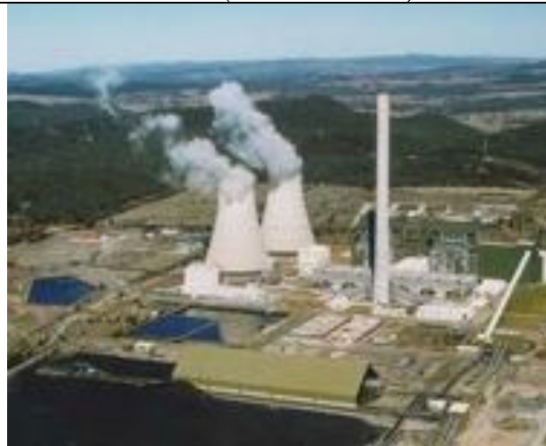
Mount Piper - 2 x 660 MW units.

Black bituminous coal. Condensate cooling: lake water.