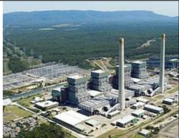
Eraring - 4 x 660MW Units.

Black bituminous coal. Condensate cooling: cooling towers. (One unit off-line.)